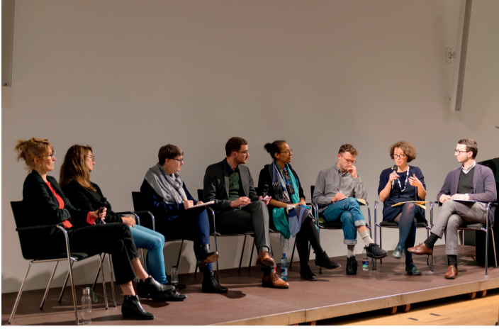
Second Experts' Panel Meeting, ZHdK, 4.-5.5.2018