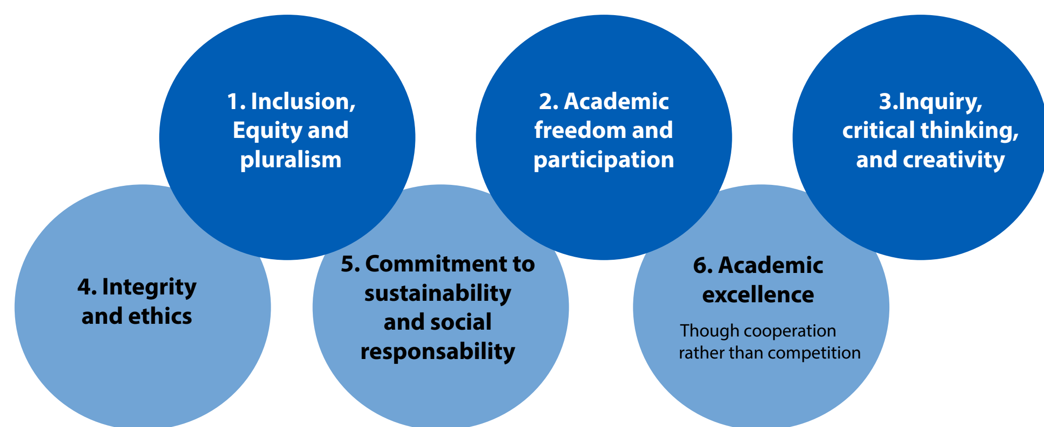
Figure 1. Principles to shape the future of higher education